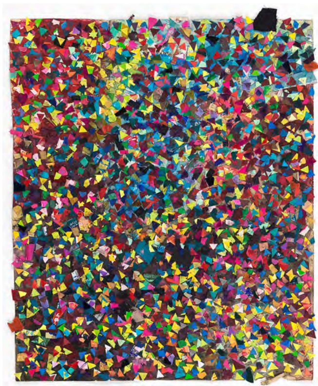
Hans Andersson, «untitled», 2020, Mixed media on found paper, 49.5 × 42 cm