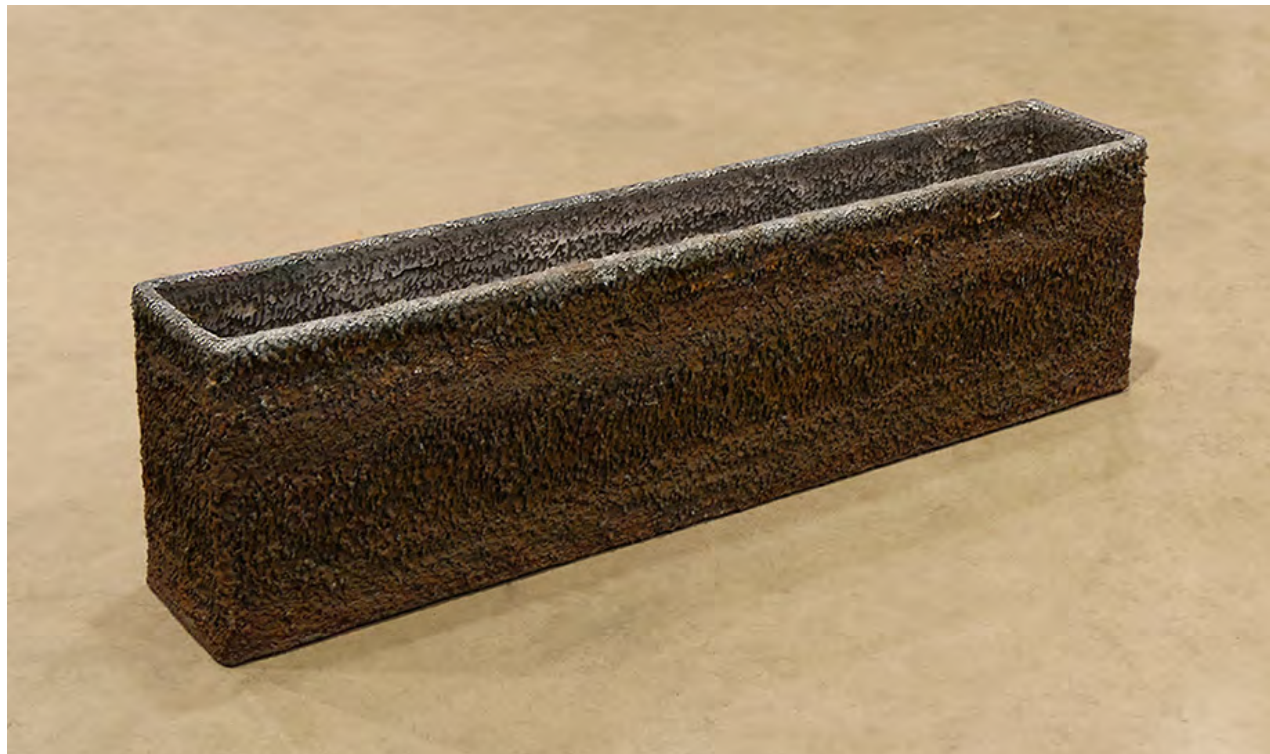
Hana TOBARI 《EFFECT》 Iron, 160 × 24 × 45 cm, 2017

November 13 (Fri.) - December 6 (Sun.), 2020