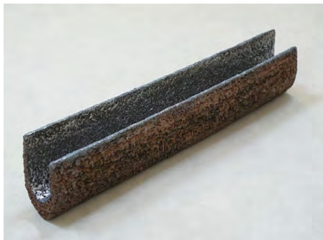
Hana TOBARI 《edge》 Iron, 70 × 70 × 15 cm, 2017